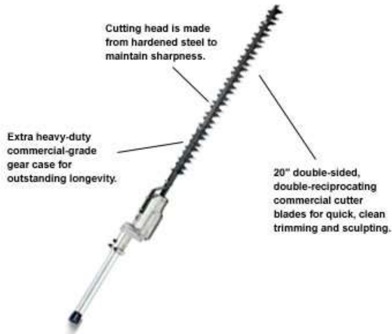
20" Long Double Sided Hedge Trimmer

Can use 3' Attachment for greater reach at no charge