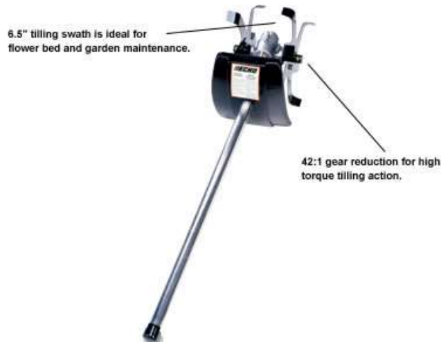
6.5" Tilling swath – 42:1 Gear Reduction provides high torque